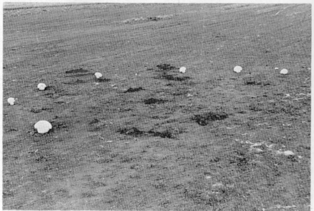
Necochea runway and grotesque "fairy ring"

"It is understood that they found the soil totally burnt over an area 6 metres in diameter. Within this circular area there were eight mushrooms, some of them as much as 81 cms. (32 inches) wide and 15 cms. high.